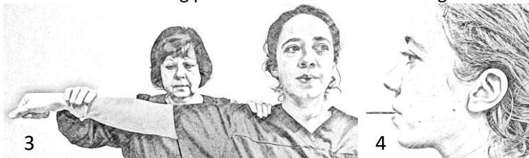
LIPS UNSTRAINED, COMFORTABLY TOGETHER

2. Instruct patient to stand with their lips together and clench on their back teeth and repeat resistance test.