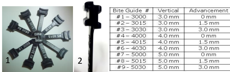
Figure 1. The Bite Guide Wheel Figure 2. Side view of Bite Guide Stick

A. Find the proper Bite Guide Stick: Determining the correct maxillo-mandibular relationship is the essential first step to making the CPAP ALLY appliance. The wheel has 9 premeasured break-away Bite Guide Sticks, numbered 1-9. Each one has a measurement code described in the table above. The VERTICAL dimension is 3, 4 or 5 mm. The PROTRUSIVE advancements of the mandible are 0 (edge to edge), +1.5 mm or +3.0 mm. When placed in patient's mouth, the numbers on the handle of the bite guide should be faced up.